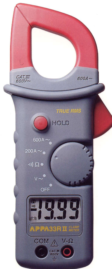
APPA 33II APPA 33RII(True-RMS reading)

4000 count high resolution AC 400A, 600V Capability Autoranging 1.2% basic ACV accuracy 1.9% basic ACA accuracy 1.9% basic OHM accuracy Continuity buzzer Up to 29mm (600MCM) conductor 600V circuit protection Display hold function Auto power off 4 feet drop proof Insulated input jacks Hand guard protection Deluxe carrying case IEC 1010-1 CAT II 600V