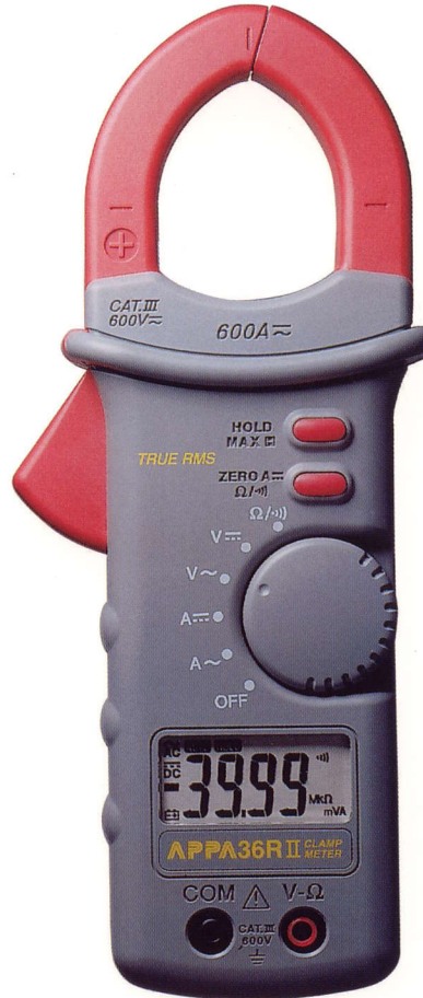
APPA 36II APPA 36R II (True-RMS reading)

4000 count digital resolution Autoranging Dual Hall sensor Nickel-Steel alloy jaw mechanism AC/DC 300 Amps capability AC/DC 600 Volts capability 0.5% basic DCV accuracy 1.5% basic ACV accuracy 1.0% basic DCA/ACA accuracy 0.9% basic OHM accuracy Continuity Beeper 10mA resolution Auto-Zeroing key for DCA Data hold function MAX hold function Auto Power off selectable 600V protection in every range Up to 22mm dia (350 MCM) conductor 4 feet drop proof Insulated input jacks Hand guard designed Deluxe carrying case IEC 1010-1 CAT II 600V