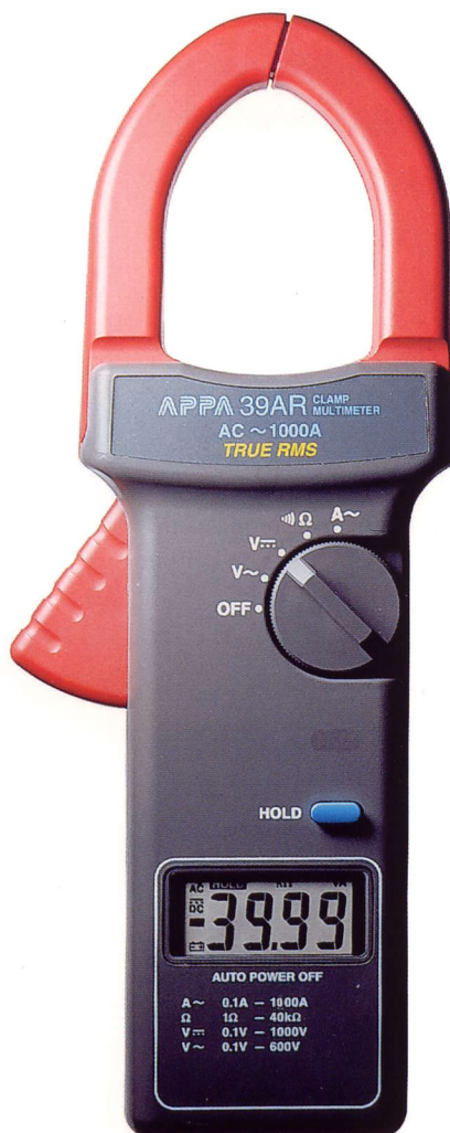
APPA39AR(True-RMS reading) APPA 39 AC

2000 count large scale LCD display AC 600 Amps capability AC 600 Volts capability 2000 Ohms Resistance range True RMS ACV/ACA (APPA33RII) Continuity Beeper Display Hold 600 Volts circuit protection Insulated input jacks Up to 34mm dia. (750MCM) conductor 4 feet drop proof Protective carrying case Hand guard designed CAT. III 600V/CAT. II 1000V Safety Standard