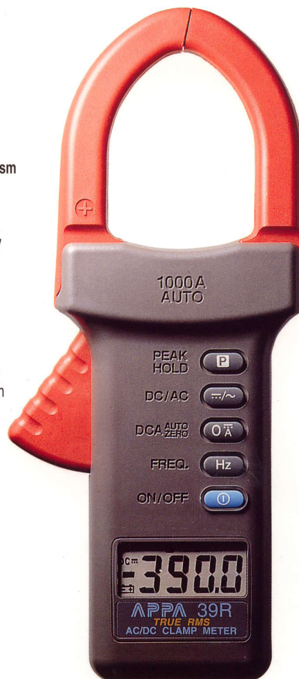
APPA 39 APPA 39R (True-RMS reading)

4000 count high resolution AC/DC 1000A in specification, and 2000A overload protection AC 600V, DC 1000V capability Autoranging Dual Hall sensor Nickel-Steel alloy jaw mechanism 0.7% basic DCV accuracy 1.2% basic ACV accuracy 1.0% basic DCA/ACA accuracy 1.5% basic ACA accuracy 1.0% basic OHM accuracy 0.5% basic Hz accuracy CONTINUITY beeper True RMS reading in ACV/ACA Frequency measurement through input jack or clamp-on PEAK HOLD function Auto-Zero key for DCA Auto Power Off Up to 51mm dia. (2") conductor Up to 24 x 60mm busbar 4 feet drop proof Insulated input jacks Hand guard designed Deluxe carrying case IEC 1010-1 CAT. II 1000V