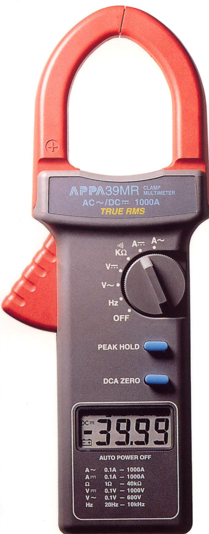
APPA 39MR (True-RMS reading)

4000 count large scale LCD display Autoranging Dual Hall Sensor AC/DC 600 Amps capability AC/DC 600 Volts capability 40M Ohms Resistance range True RMS ACV/ACA (APPA36R II) Continuity Beeper Display Hold Maximum Hold Auto-Zeroing Key for DCA Auto Power off selectable 600Volts Circuit protection Insulated input jacks Up to 35mm dia. (750MCM) conductor Up to 40x15mm busbar 4 feet drop proof Deluxe carrying case Hand guard designed CAT. III 600V Safety Standard