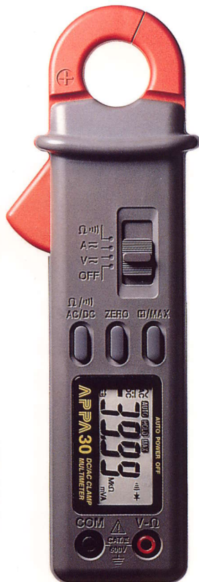
APPA 30 APPA 30R (True-RMS reading)

4000 count digital resolution Autoranging Dual Hall sensor Nickel-Steel alloy jaw mechanism AC/DC 300 Amps capability AC/DC 600 Volts capability 0.5% basic DCV accuracy 1.5% basic ACV accuracy 1.0% basic DCA/ACA accuracy 0.9% basic OHM accuracy Continuity Beeper 10mA resolution Auto-Zeroing key for DCA Data hold function MAX hold function Auto Power off selectable 600V protection in every range Up to 22mm dia (350 MCM) conductor 4 feet drop proof Insulated input jacks Hand guard designed Deluxe carrying case IEC 1010-1 CAT II 600V