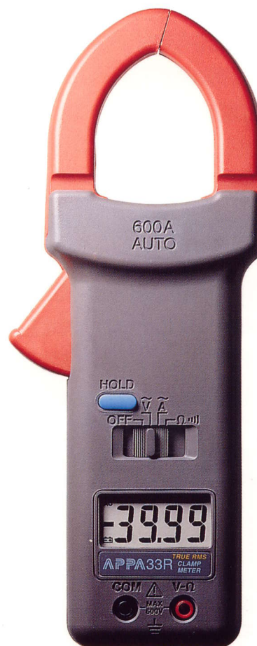
APPA 33 APPA 33R (True-RMS reading)

4000 count high resolution AC 1200A in specification AC 1000A in specification (39AR) 1500A overload protection AC 600A, DC 1000V capability Autoranging 1.2% basic ACV accuracy 1.2% basic DCV accuracy 2% basic OHM accuracy CONTINUITY beeper True RMS reading in ACV/ACA Up to 51mm dia. (2") conductor 600V circuit protection Display HOLD function Auto Power Off Insulated input jacks Hand guard designed Deluxe carrying case IEC 1010-1 CAT. II 1000V