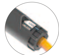
Connection lock mechanism